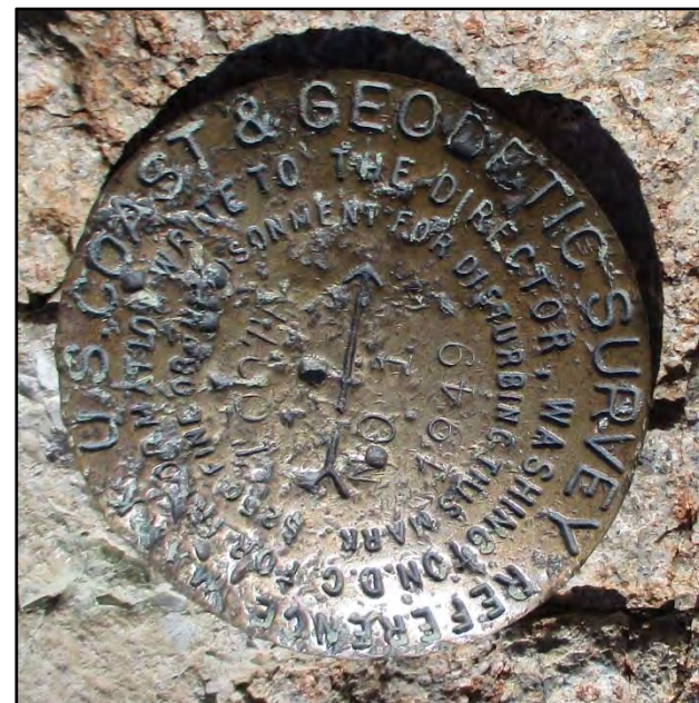
U.S. Coast & Geodetic Survey Reference Benchmark at the summit of the Tooth of Time Photo taken July 3, 2016

This CSP first in the Mecklenburg County Council PSR Benchmark Series ® that features important Survey Benchmarks of special significance at Philmont. 515 were made.